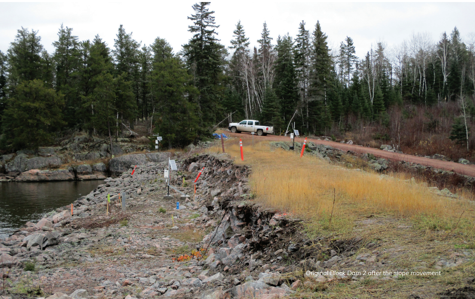
Original Block Dam 2 after the slope movement

Through review of original as-constructed documents and back-analysis using numerical slope stability modelling software, it became obvious that the slide must have occurred through the embankment clay core and the clay blanket. The precise root cause or event that triggered the upstream slide after almost 60 years remains unclear, and the stability of the rest of the dam was unknown. Given the high importance of maintaining the integrity of the dam, and not fully knowing why the slide occurred, OPG sanctioned the complete replacement of Block Dam 2.