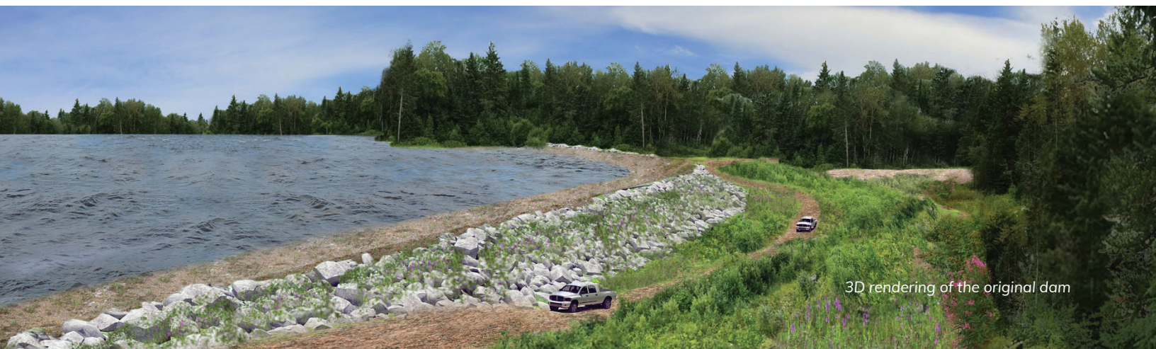
3D rendering of the original dam

With the design complete and a tender package ready, OPG shortlisted a pool of qualified contractors and invited bid submissions. The contract aggressively specified that execution of the project be substantially completed within one construction season.