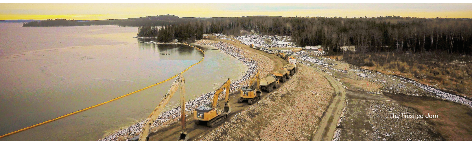
The finished dam

Despite unforeseen challenges and adversity, the team persevered using a “One Team” approach. As a result, the project was successfully completed under budget and ahead of schedule without any safety incidents. It also benefited the WIN community and restored public safety and generation capacity while preserving the natural surroundings in this wild and beautiful setting.