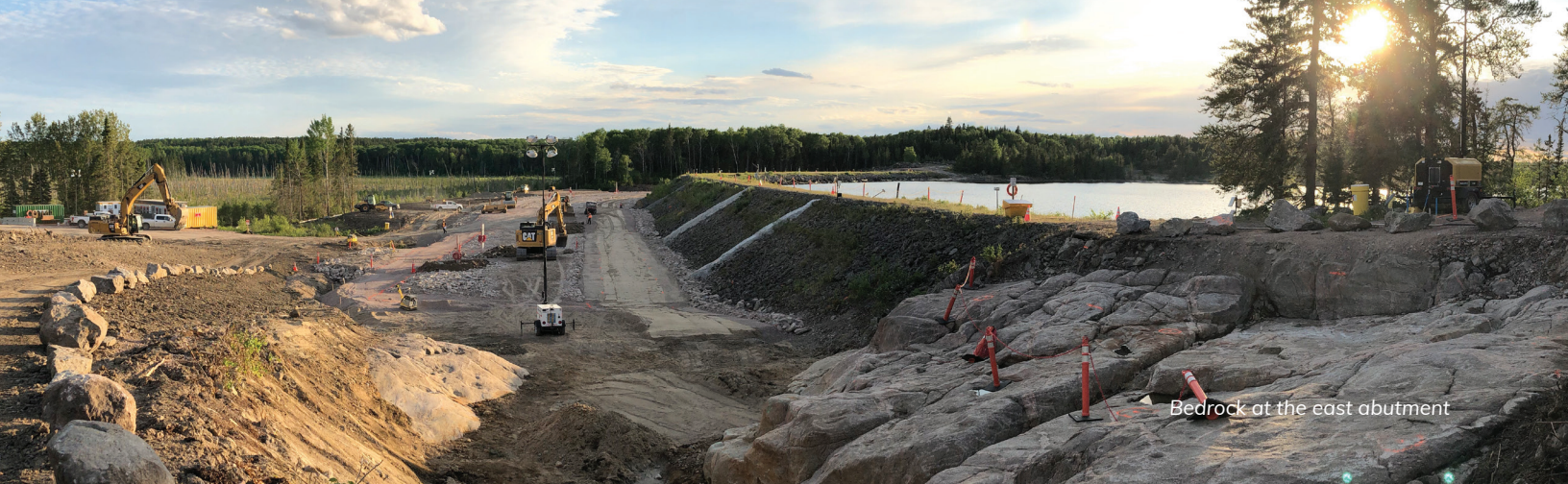
Bedrock at the east abutment