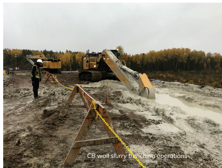
CB wall slurry trenching operations

Even with the diverse set of tools at the team’s disposal, the tough ground conditions in the east area pushed the two heavy machines to their maximum capacity. Equipment break-downs, dense cobble zones, and boulders up to 1 m in size made for some tense moments, as this was the team’s one chance to build this critical dam element through this area. After ten long and strenuous days and nights, Kiewit successfully made it through, and continued to complete the entire CB wall after three more weeks.