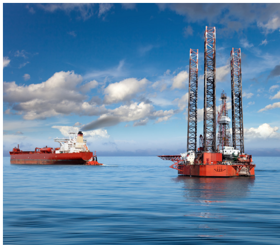
Area Risk Assessment for Ship-Source Spills - 2018 Award of Excellence.