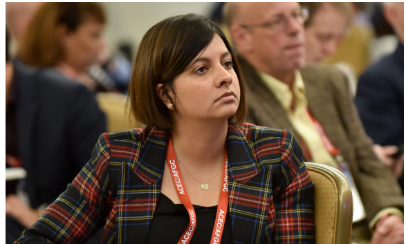
Delegate at the 2018 ACEC national leadership conference.