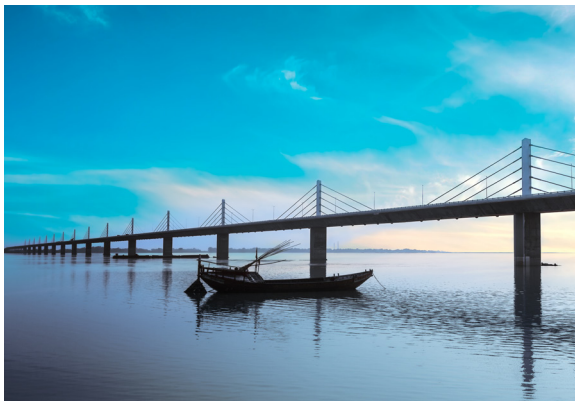
Veer Kunwar Singh Bridge - 2018 Ambassador Award.