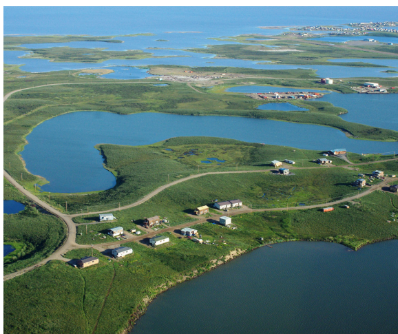
Inuvik Tuktoyaktuk Highway - 2018 Engineering a Better Canada Award.