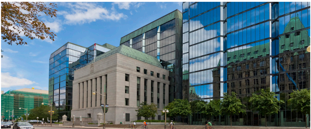
Bank of Canada Head Office Renewal Project - 2018 Award of Excellence.

Atlantic Engineering Consultants Ltd. Core Engineering Inc. Crosbie Engineering Ltd. DMG Consulting Limited Harris & Associates Ltd. Meridian Engineering Inc. Nova Consultants Inc. Progressive Engineering & Consulting Tiller Engineering Inc.