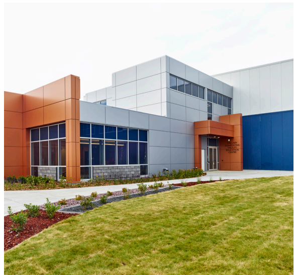
Calgary Compost Facility - 2018 Awards of Excellence.

examined how economic participation by First Nations in major projects could be facilitated; how environmental considerations can be examined within a new framework; and how traditional First Nation approaches can add value in advancing major project development.