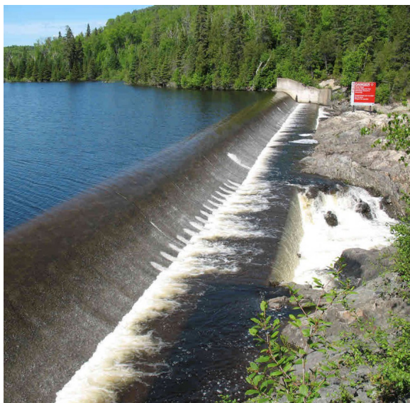
Reducing Life Safety Risks to the Kashechewan First Nation Community - 2018 Award of Excellence.