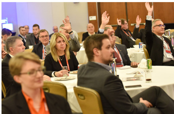
Participants at the 2018 ACEC national leadership conference.