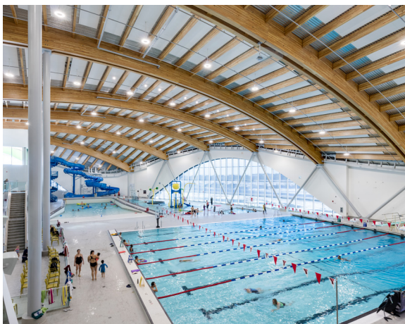
Shane Homes YMCA at Rocky Ridge - 2018 Award of Excellence.