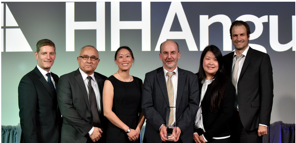
Engineering excellence was recognized at the 2018 Canadian Consulting Engineering Awards gala.