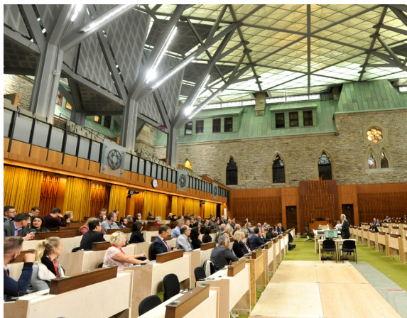
ACEC national leadership conference delegates tour Parliament Hill's West Block.

Professional development through live webinars was a great success again this year. Following the success of our first series of webinars, a second one was launched aimed at helping managers and young professionals develop the skills required for a successful career in the consulting engineer industry.