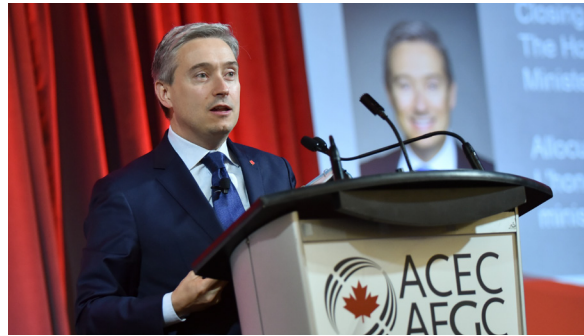
The Honourable François-Philippe Champagne during the 2018 ACEC national leadership conference.

Companies and FIDIC to observe trends and stay current on best practices in the industry.