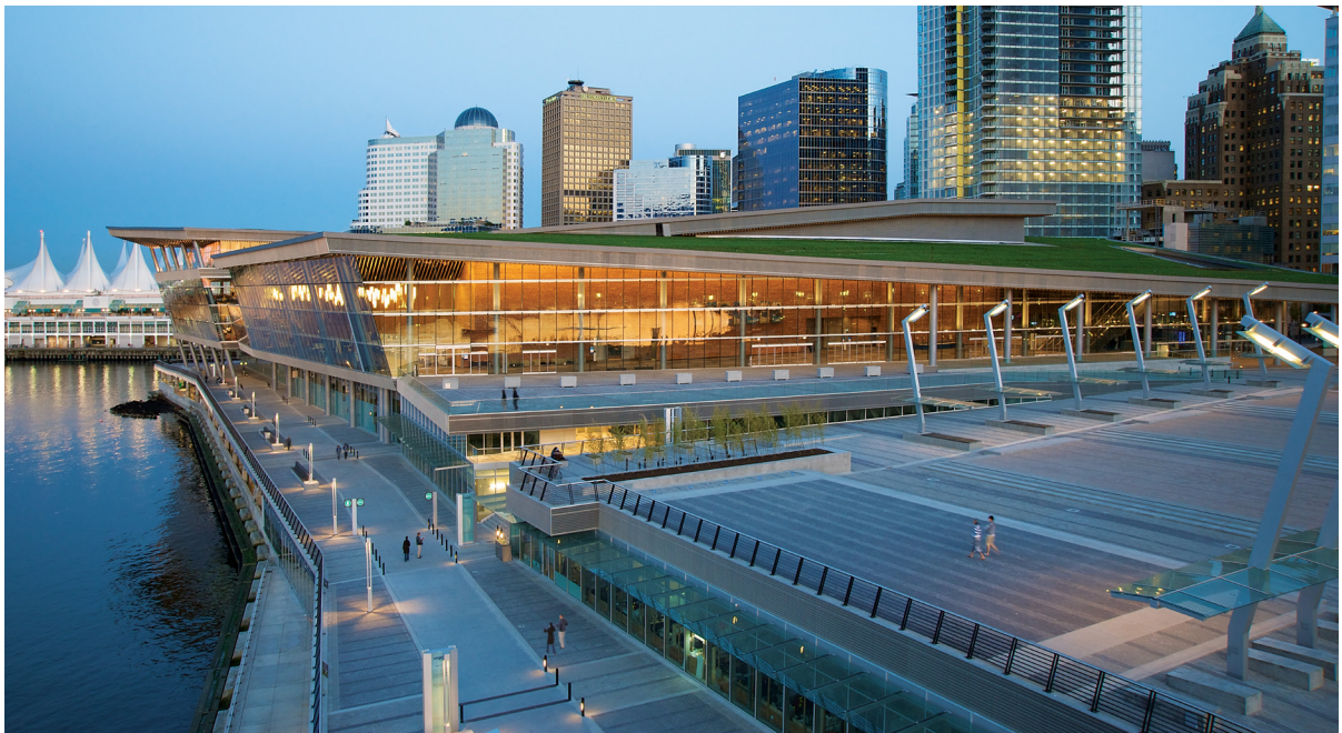
Vancouver Convention Centre West Sustainability Consulting and LEED® Platinum Project Management - 2018 Award of Excellence.