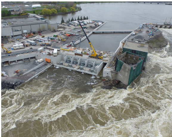
Chaudière Falls Hydroelectric Redevelopment Project - 2018 Award of Excellence.