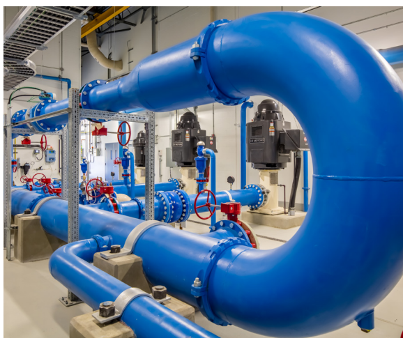
Drayton Valley Water Treatment Plant - 2018 Award of Excellence.

The ACEC national leadership conference, which took place in October, is the only opportunity for members to come together from across the country to learn of the latest industry trends, challenges and opportunities, and to network with peers and national decision makers. The business program featured an impressive line-up of Ministers, industry experts, thought leaders and media pundits who shared and interacted with the delegates on a host of issues.